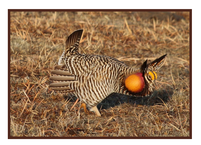
25th Anniversary

The tour includes evening orientation at the Wray Museum with educational & historical background on the Greater Prairie Chicken; early morning viewing in a comfortable blind with a Colorado Division of Parks and Wildlife officer; and a ranch style breakfast at the headquarters of the Kitzmiller Grazing Association.